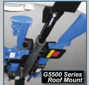
G5500 Series Roof Mount