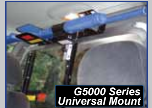
G5000 Series Universal Mount