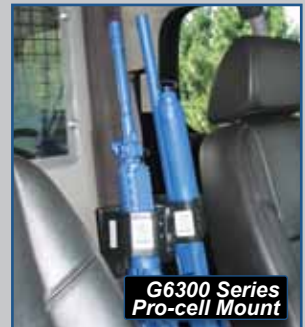
G6300 Series Pro-cell Mount