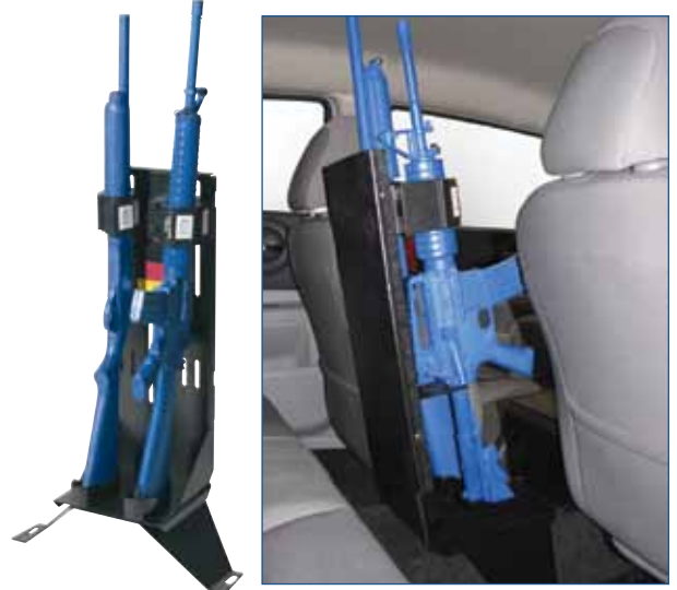
Shown in Dodge Charger

Gun locks are determined by a combination of mounting location, weapon type, and weapon accessories*