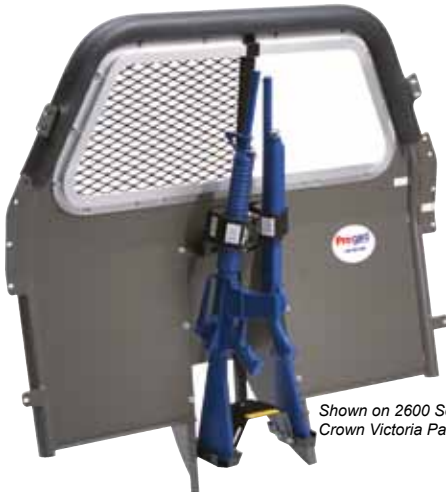
Shown on 2600 Series Crown Victoria Partition