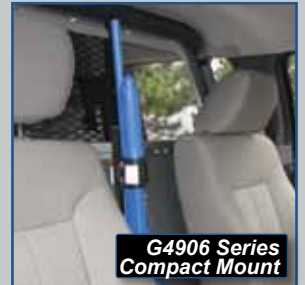
G4906 Series Compact Mount