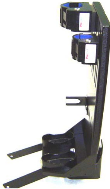
G7252 VERTICAL GUN RACK WITH MOUNT

This instruction sheet is for Impala Police Cruiser applications only.