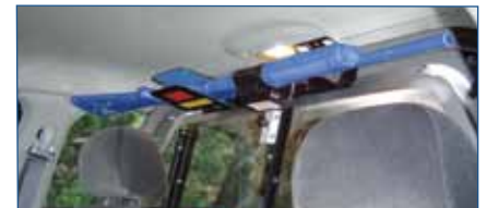
Horizontal Mount Gun Rack shown in Chevrolet Impala

Horizontal or Vertical Gun Rack Mounting for hundreds of weapon configurations