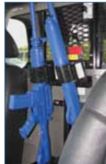
Vertical Mount, Gun Rack shown in Chevrolet Tahoe